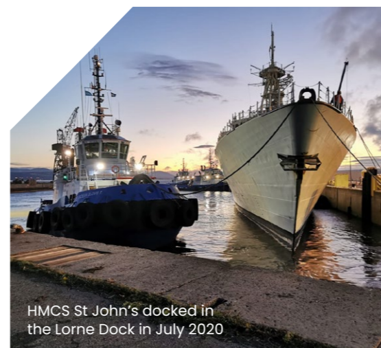
HMCS St John's docked in the Lorne Dock in July 2020

Vessel Life Extension Programs The Canadian Coast Guard has a multi-ship Vessel Life Extension (VLE) Program for three aging Type 1100 icebreakers, which typically operate year round performing a range of tasks and support services primary on Canada's East Coast. Work is scheduled to begin from 2022 on one vessel per year. The value of the contract of each ship is in the $75 million range.